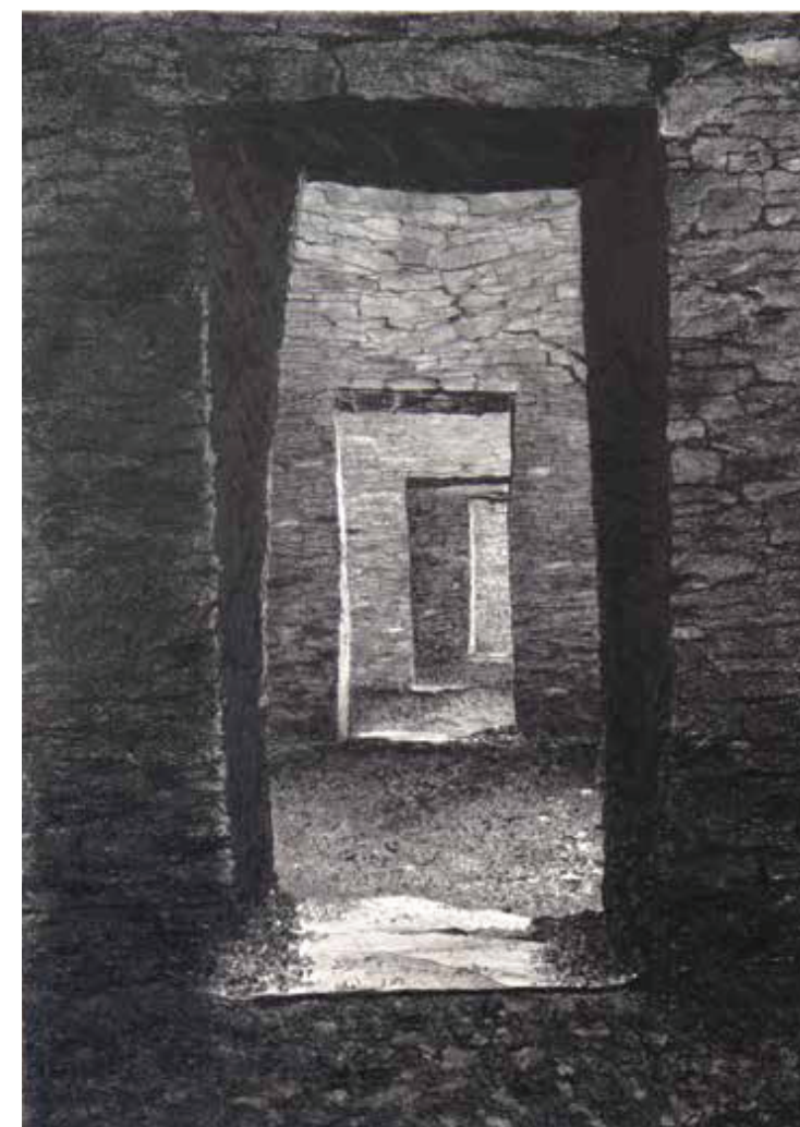
Philip Carpenter Doorways—Chaco Canyon